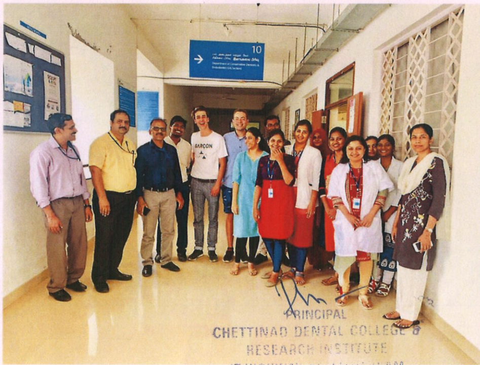
PRINCIPAL CHETTINAD DENTAL COLLEGE & RESEARCH INSTITUTE IT HIGHWAY KETANURAM KANCHIPURAM DIST 603 103