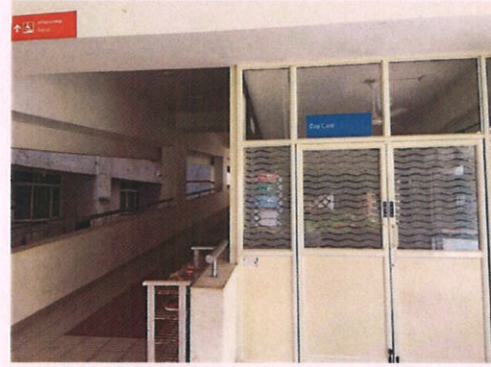
Day care centre for young children

PRINCIPAL CHETTINAD DENTAL COLLEGE & RESEARCH INSTITUTE IT HIGHWAY RELAMBAKKAM KANCHIPURAM DIST - 603 103