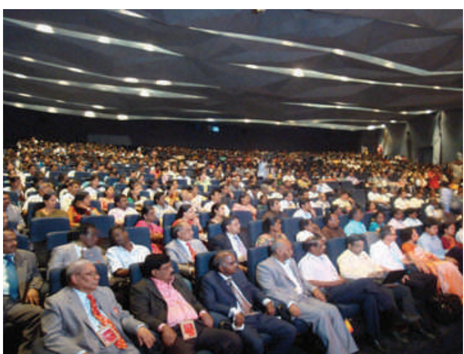
Sigappi Achi Convention Centre Hosting a Conference