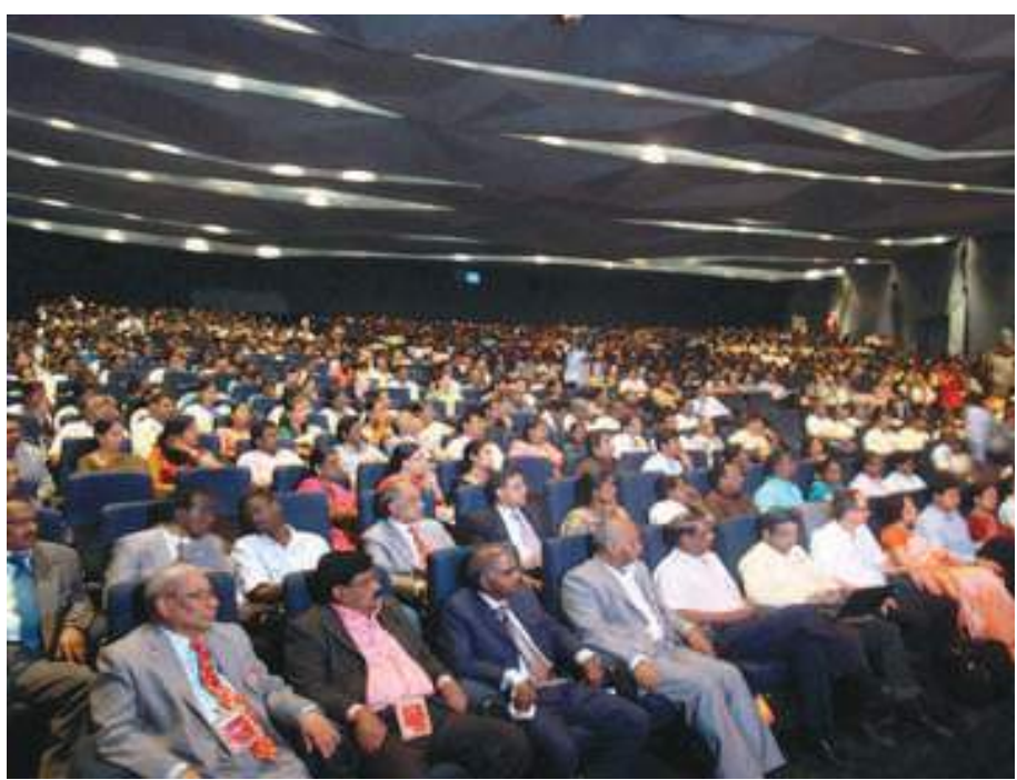
Sigappi Achi Convention Centre Hosting a Conference