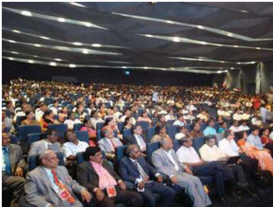
Sigappi Achi Convention Centre Hosting a Conference